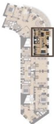
VÝMĚRA BYTU / FLAT AREA