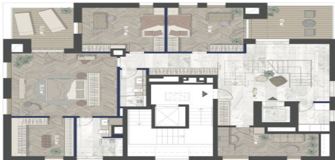
2. NP 2ND FLOOR