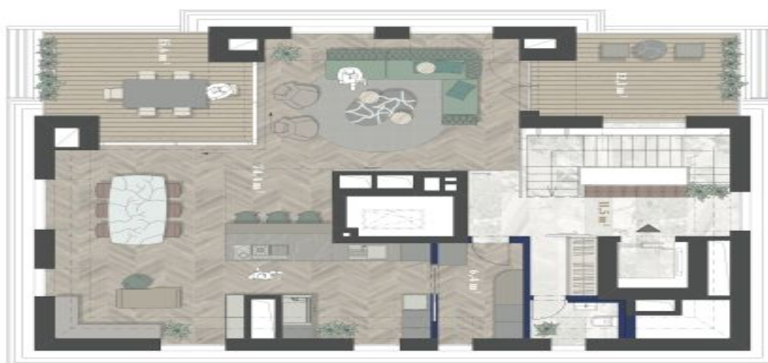
1. NP 1ST FLOOR