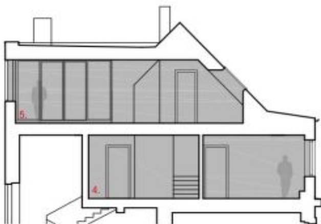
LEGENDA / LEGEND