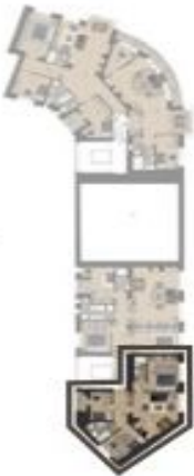
PODLAŽÍ / FLOOR